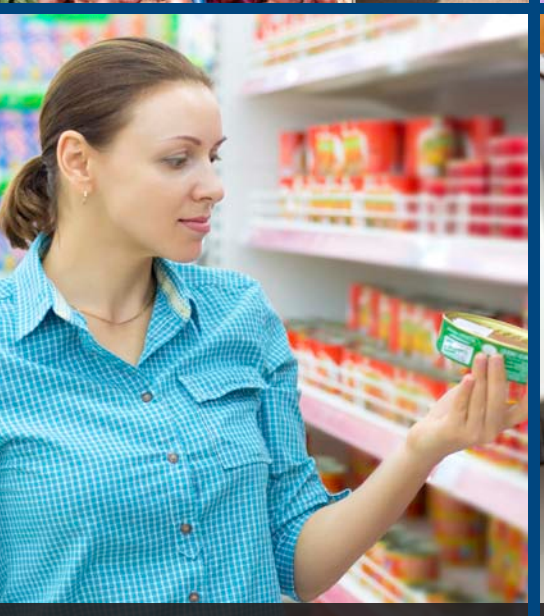
FOOD CONTACT MATERIALS