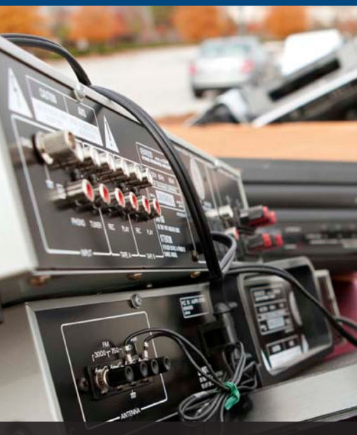
ELECTRONICS AND BUILDING MATERIALS