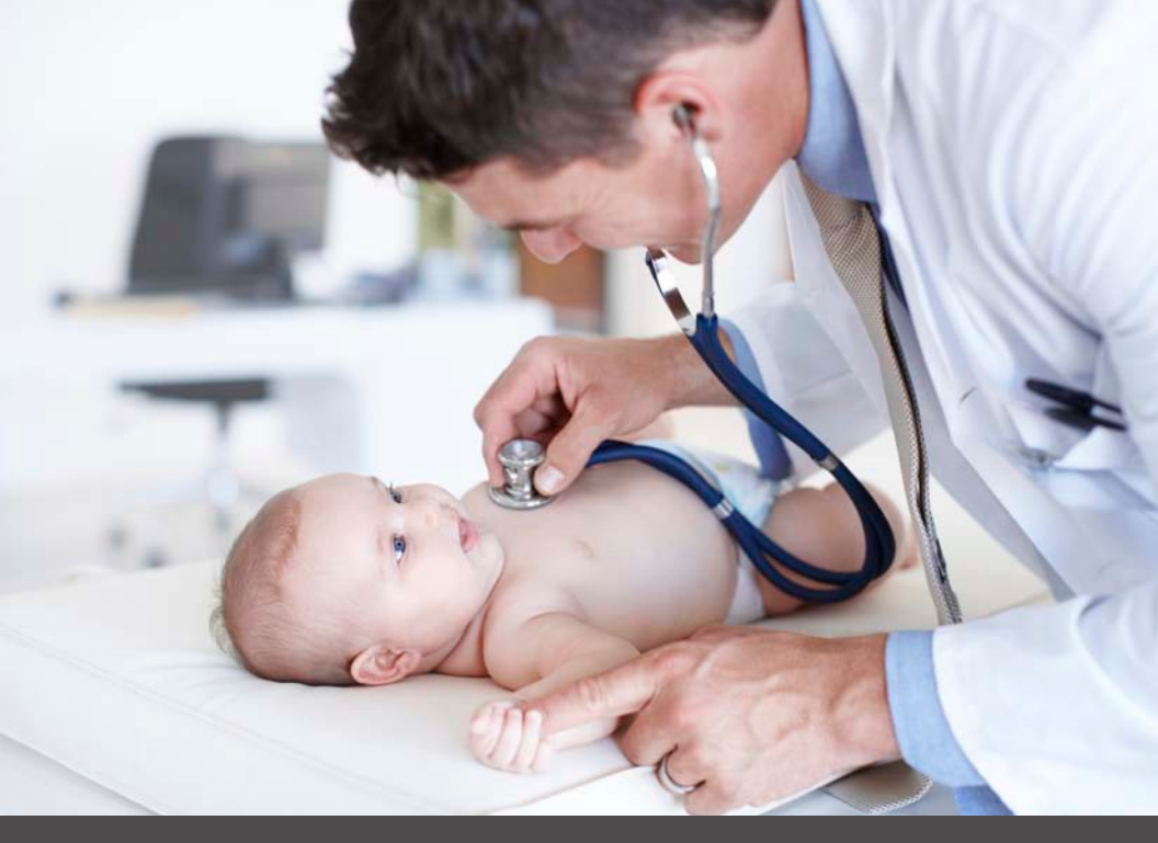
We now know that direct exposures of an individual to EDCs cause a range of behavioral, endocrine, and neurobiological problems. This requires a paradigm shift in how to conduct risk assessment.