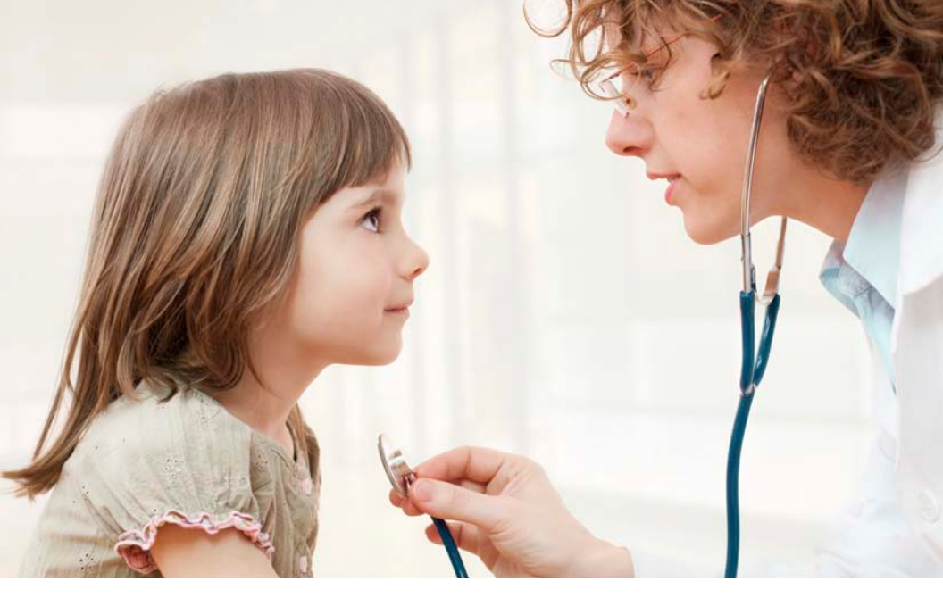
There is good reason to suspect that increasing chemical production and use is related to the growing incidence of endocrine-associated pediatric disorders over the past 20 years, including male reproductive problems (cryptorchidism, hypospadias, testicular cancer), early female puberty, leukemia, brain cancer, and neurobehavioral disorders.

exist in the body in combination due to prolonged or continual environmental exposures. Also like natural hormones, EDCs have effects at extremely low doses (typically in the part-per-trillion to part-per-billion range) to regulate bodily functions. This concept is particularly important in considering that exposures start in the womb and continue throughout the life cycle. A new type of testing is needed in order to reflect that EDCs impact human health even at the low levels encountered in everyday life.