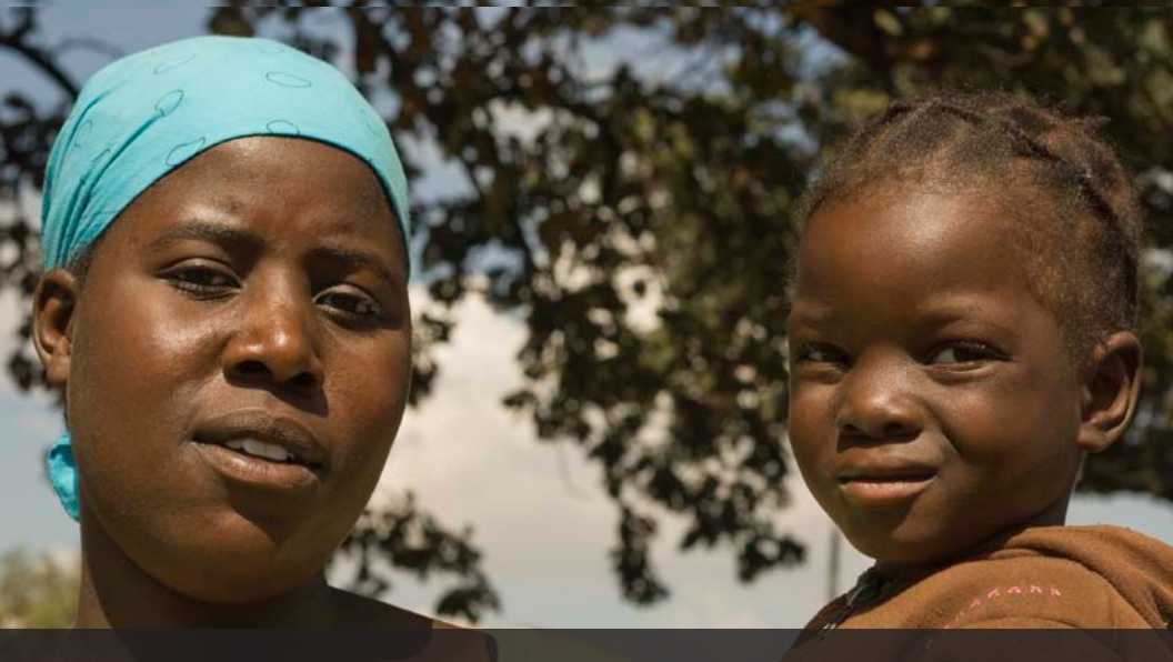
When humans are tested for the presence of EDCs in their blood, fat, urine, and other tissues, the results consistently demonstrate a variety of EDCs in all individuals worldwide.

Not surprisingly, chemical contamination of the environment has been proven to affect humans and further discussion of this will be provided below. But the most direct evidence for cause and effect came from several large-scale disasters in which humans were exposed to varying amounts of chemicals, including both high levels, which were acutely toxic, and lower levels, which have now been shown to cause more chronic, subtle, and long-lasting effects. One example is the explosion of a chemical manufacturing plant in Seveso, Italy, that exposed residents to high levels of dioxins. Two more tragic exposure examples are Yusho in Japan (PCBs), and Yucheng in Taiwan (polychlorinated dibenzofurans) in which contaminated cooking oil caused mass poisoning. Of recent concern is the poisoning of schoolchildren in India in July 2013 through oil contaminated with the organophosphate pesticide monocrotophos, which resulted in 23 deaths. The long-term endocrinedisrupting effects of monocrotophos remain to be seen, although there is evidence of estrogenicity from studies on mice and fish (8, 9). Another common route of human exposure is in agriculture with the routine seasonal spraying of crops with pesticides. This established practice can create a body burden that affects exposed workers, nearby residents, consumers of the food, and even future generations, as described below.